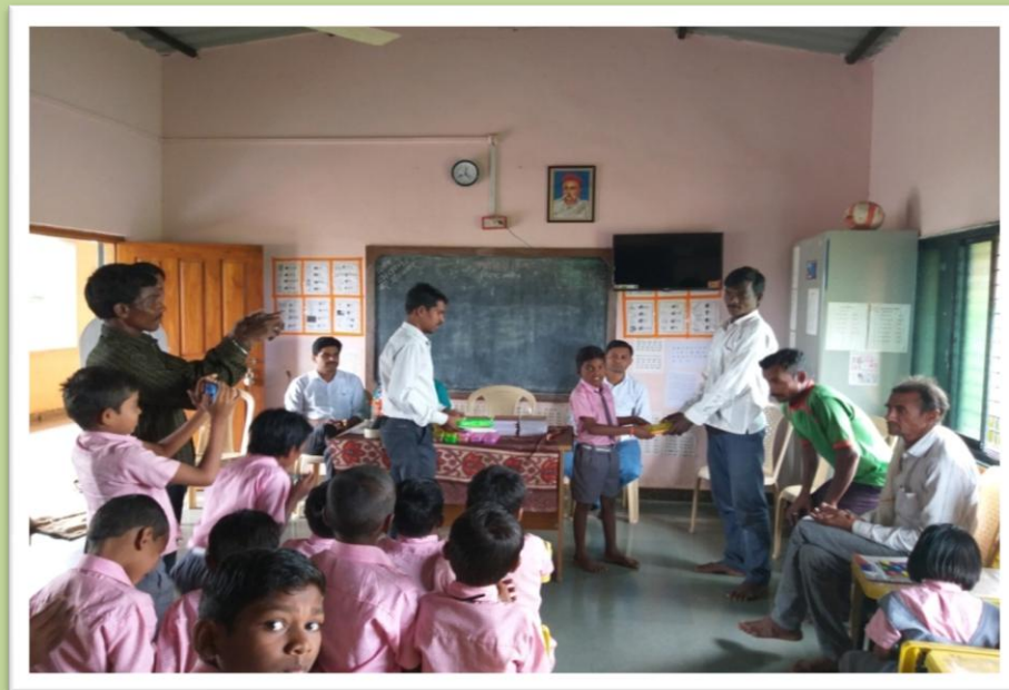
Distributing Education Material for Student At Manbhang, Tq-Chikhaladara, Dist-Amravati