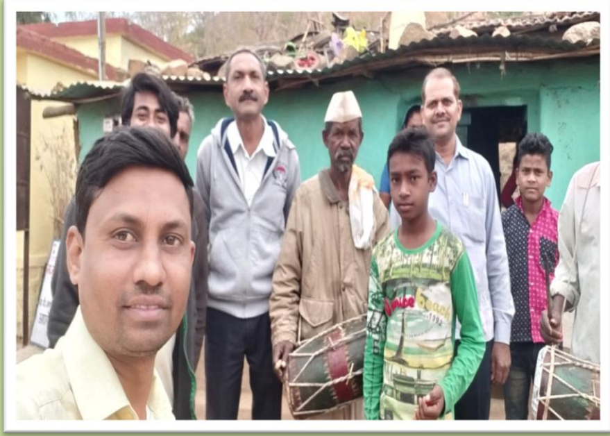
Village People Cultural Program At Manbhang, Tq-Chikhaladara, Dist- Amarvati