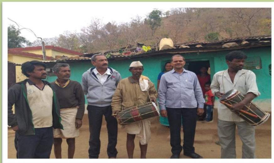
Village People Cultural Program At Manbhang, Tq-Chikhaladara, Dist- Amarvati