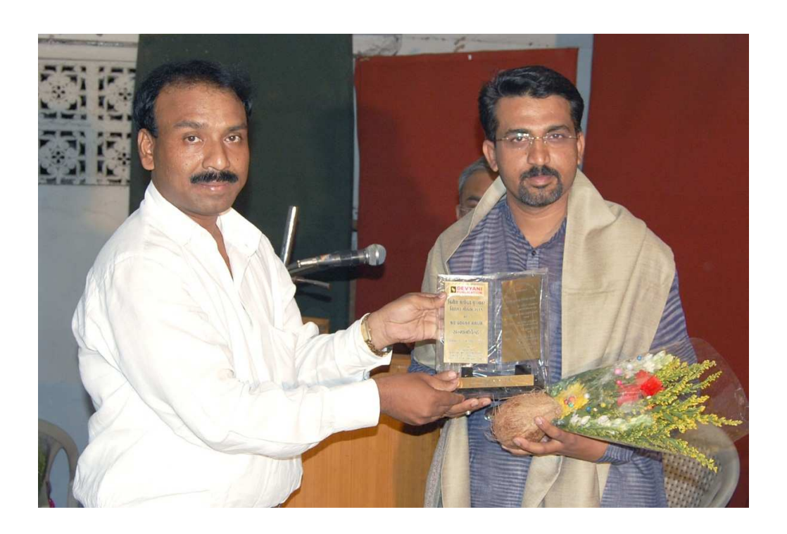
24. "Mahanubhav Gaurav Sanman-2012" given by Mahanubhav Sahitya Mahamandal, Amravati

23. "State Level Granthoday Award-2011" given by Devyani Publication, Mumbai.